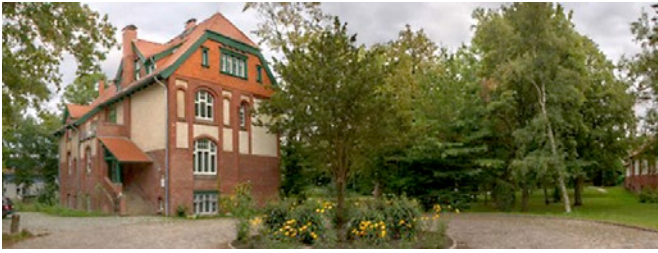
House of the Michael Succow Foundation in Greifswald