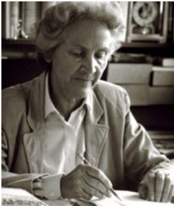
Marion Gräfin Dönhoff